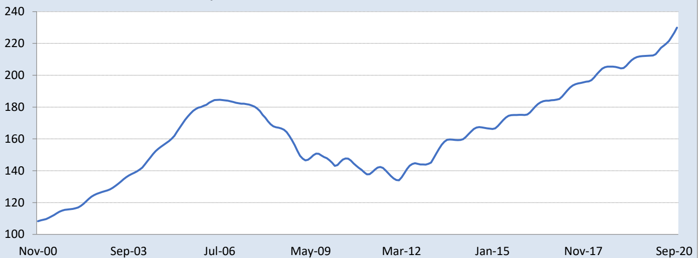
S&P/Case-Shiller U.S. National Home Price Index